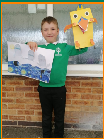
"I made the origami pterodactyl and the fish are sardines"