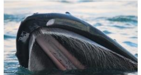
what do they eat?

North Atlantic right whales have been listed as endangered under the Endangered Species Act since 1970. The latest estimate suggests there are fewer than 350 remaining, with fewer than 70 breeding females. The number of new calves born in recent years has been below average.