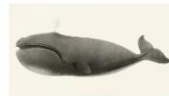
this is what they look like