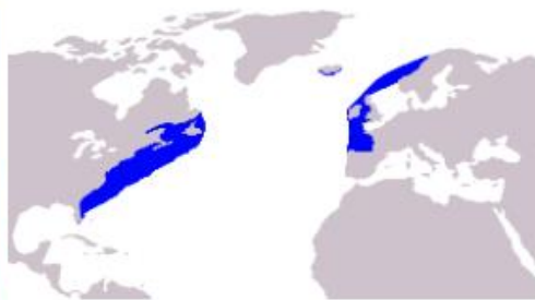
where do they like?

They are endangered because they were hunted for many years. Now there are getting caught in fishing nets and being hit by ships are the main causes of North Atlantic right whale death. Increasing ocean noise levels from human activities are also a concern since the noise may interfere with right whale communication and increase their stress levels.