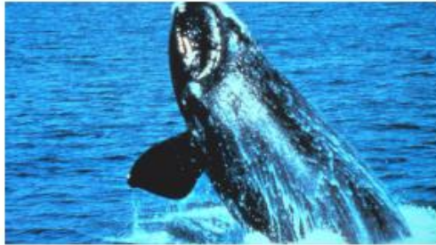
North Atlantic right whale

They are endangered because they were hunted for many years. Now there are getting caught in fishing nets and being hit by ships are the main causes of North Atlantic right whale death. Increasing ocean noise levels from human activities are also a concern since the noise may interfere with right whale communication and increase their stress levels.