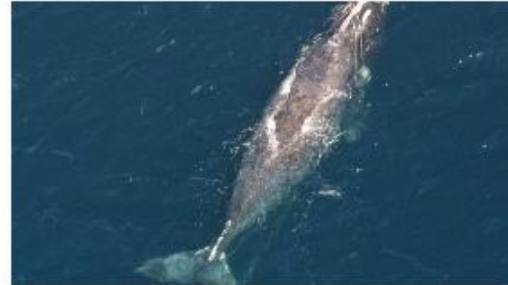
how many are left

North Atlantic right whales mainly live in Atlantic coastal waters off the coast of North America and northern Europe, although they also are known to travel far offshore, over deep water.